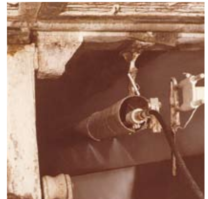
Electrically driven traverse beam with fan nozzles