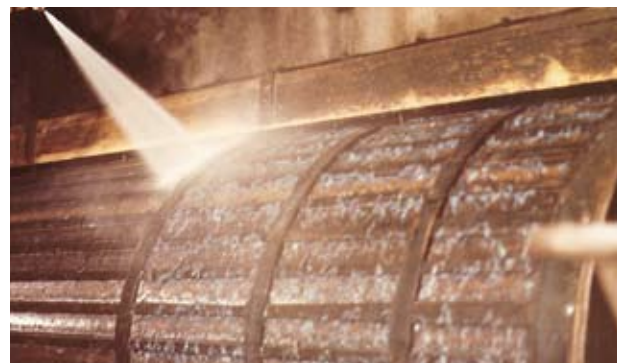
Cleaning of sieve-suction-rollers with high-pressure water lances