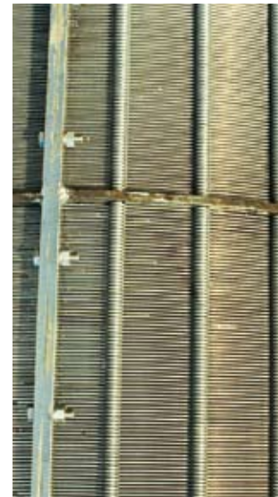
Cleaning results on a filter cleaned by high-pressure water jetting