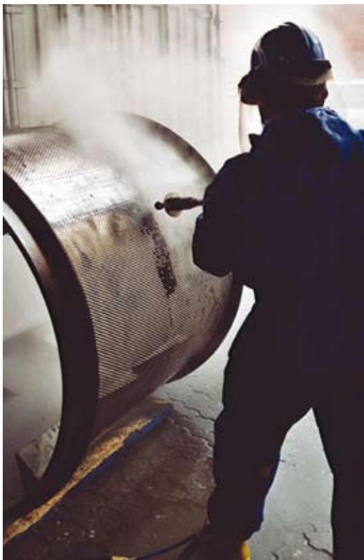
Cleaning of sieve sections with hand-held water jet tools