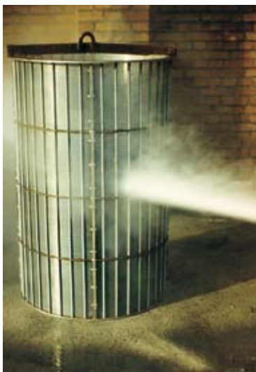
Filter cleaning using a high-pressure water jet