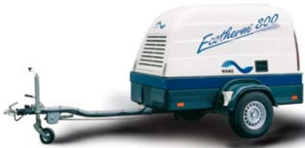
Hot waterjetting system Ecotherm® 800 for efficient sieve cleaning