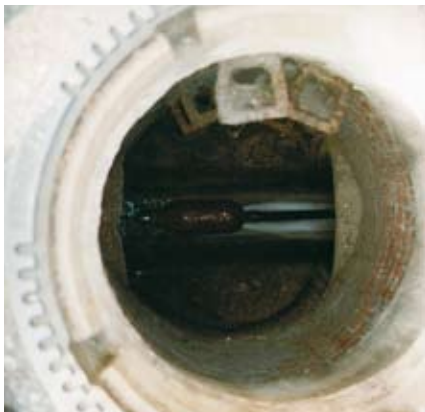
Sewer channel bottom cleaning with a Skip Jack nozzle