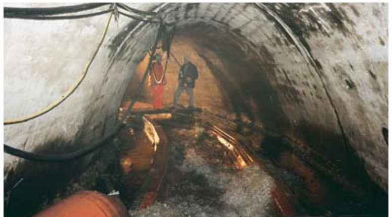
Removal of cement-based flat coat in man-sized channels by high-pressure water jet tools