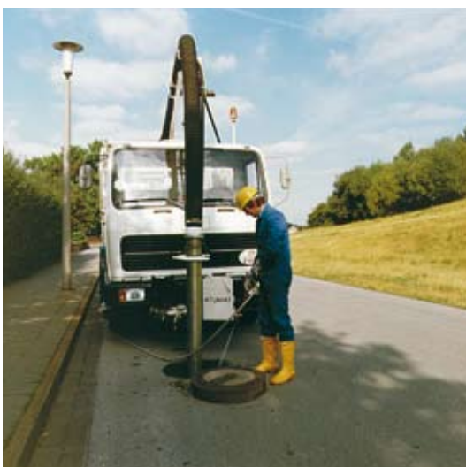
Combined suction-cleaning vehicle for sewer cleaning with reel, high-pressure cleaning nozzle and suction hose

Pneumatically controlled 3/2-way valve for municipal applications