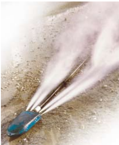
Water jetting nozzle for sewer cleaning