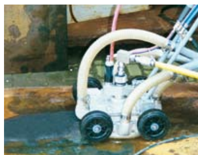
Derusting of bottom boards using the emission-free performing Vacu Jet