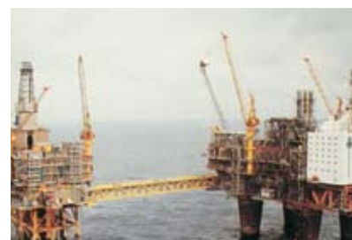
Oseberg Twin-Platform in the North Sea WOMA Ecomasters are used here successfully for surface preparation and derusting of steel surfaces