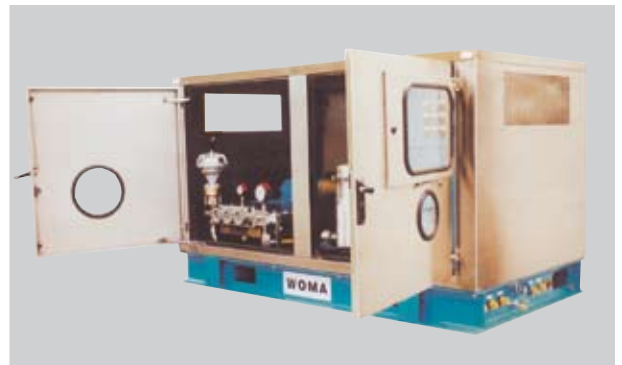
Exclusively designed WOMA Ecomaster unit for offshore applications