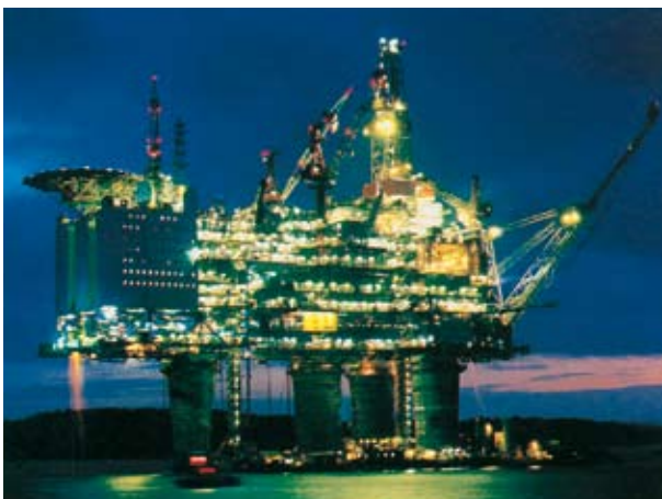
Gulfaks Gas and Oilfield At the platforms A and B, WOMA Ecomaster systems are used successfully for surface preparation, pipeline maintenance and tank cleaning