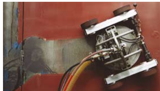
Lizard with remote control for emissions-free large-scale surface preparation