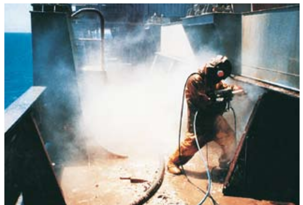
Derusting and decoating of steel surfaces using a water jet tool