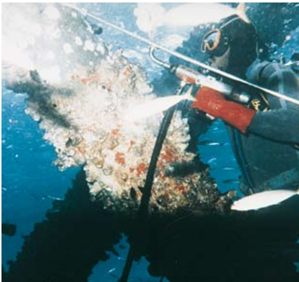
Submerged cleaning using a reaction force reduced underwater tool

▶ The amount of deposits can be reduced significantly. Compared to grit blasting, up to 98 percent less waste material needs to be removed.