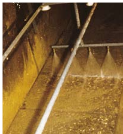
Generation of exposed aggregate concrete by fan water jets