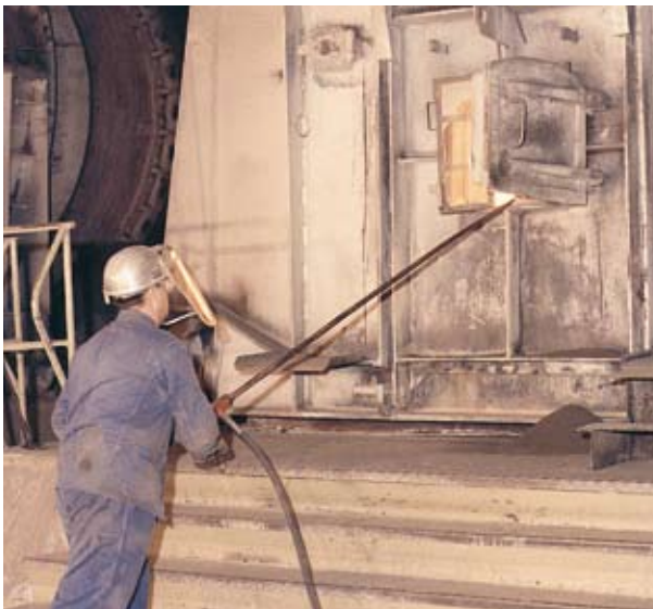
Removal of accretion rings in rotating kilns by water jet lances