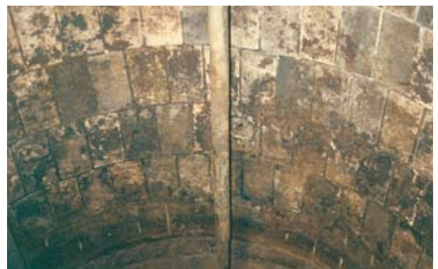
Incrustation removal from a stirrer upper: prior to cleaning, lower: after cleaning