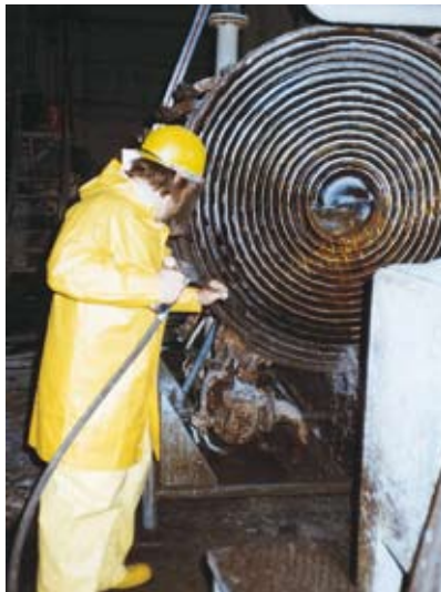
Filter cleaning in the gas concrete production