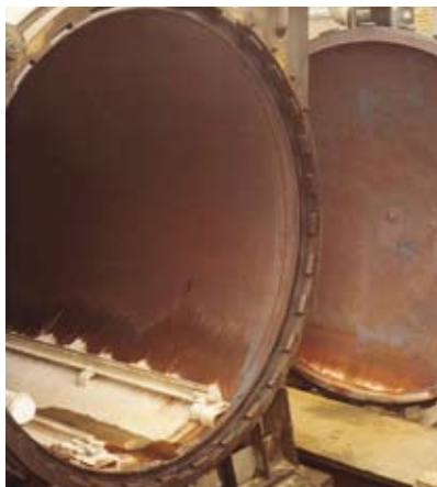
Deposit removal from lime-malm-brick tempering vessels